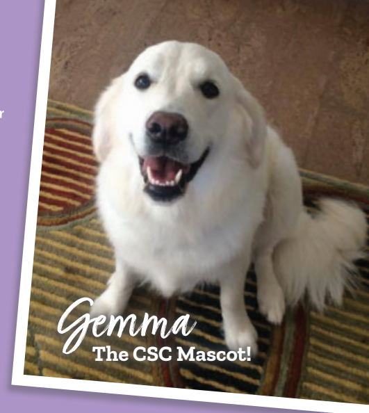
Gemma The CSC Mascot!

Thank you, Control Service Center, for sponsoring our Shelter Medicine program and Medical Access Fund in October!