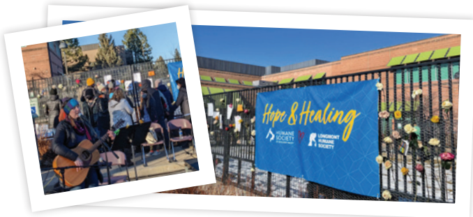
Hope & Healing Vigil at HSBV

DAYS OF FREE BOARDING PROVIDED FOR FIRE-AFFECTED PETS IN NEED