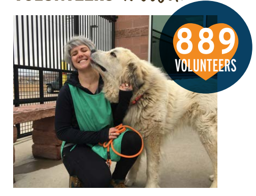
889 volunteers contributed their time and energy in support of HSBV.